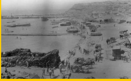
Above: Group at ANZAC Cove - Today. Top Right: The ANZAC Memorial Right: The Machine Gun was used with devastating effect by both sides at Gallipoli Left: ANZAC Cove during the 1915 Landings.